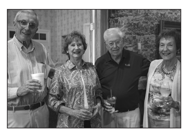
Memorial Day Fun