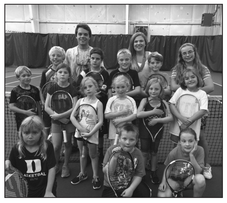
Summer Camp, June 2015