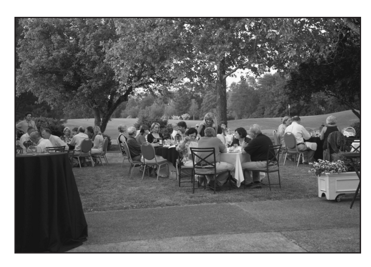
Jazz and Martini Night

Friday, August 21st, 2015 6:00pm Dinner • 7:00pm Bridge